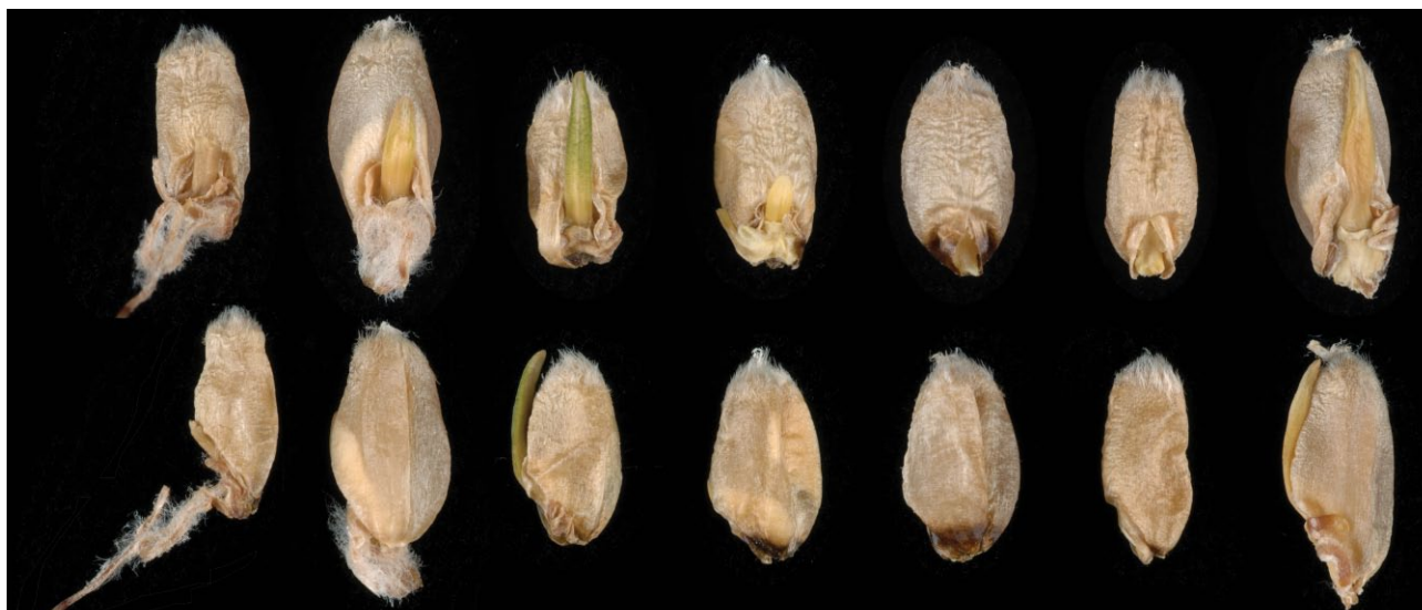
Front and back images of wheat grains that are affected by pre-harvest sprouting. They have absorbed water and have started to germinate. Those showing embryo development – shoot and or roots – will not be viable as seed.