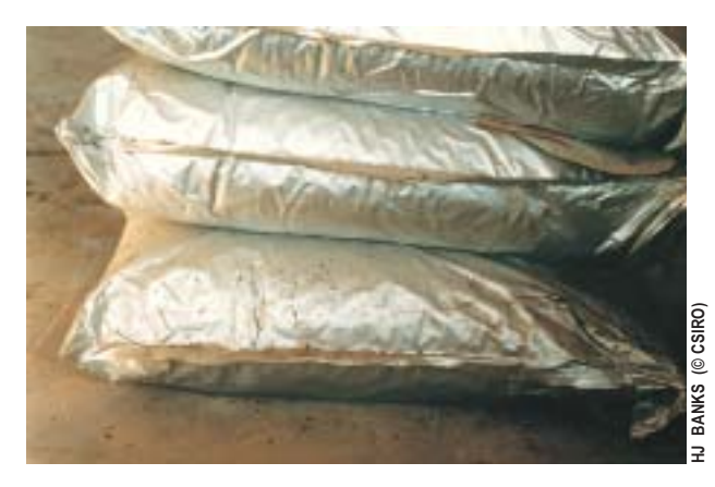
Modern hermetic storage. Wise Joseph sacks preserve seed maize and rice by hermetic storage. (Dumaguette, Philippines)

The major advantage of ambient in-store drying is the cost compared with purpose-built dryers. Both capital costs and running cost are