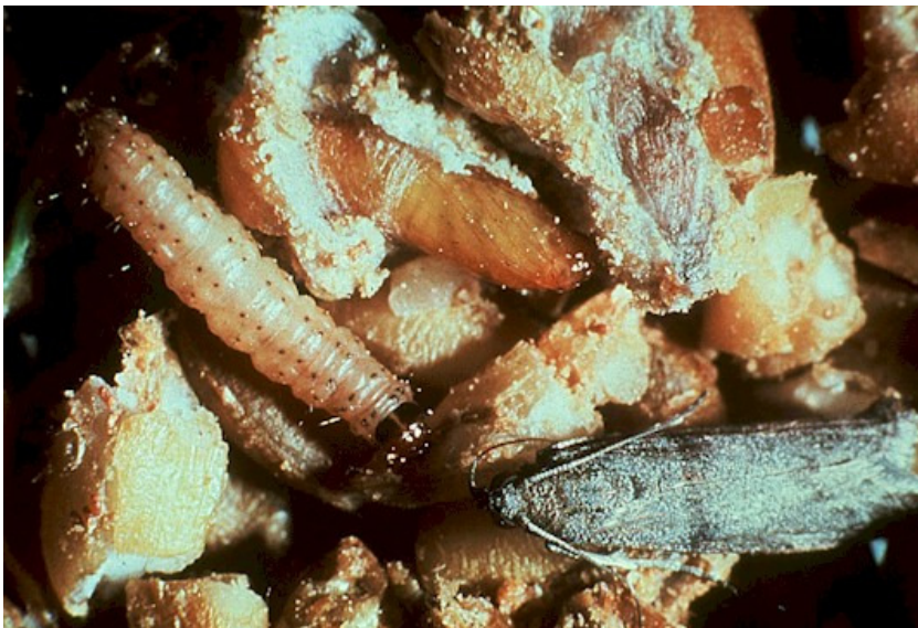
Tropical warehouse moth

Adult moths are short-lived and do not feed. They can be seen flying above the grain, particularly at dusk. Moths multiply rapidly at optimum conditions, i.e., 30 °C, 75% relative humidity.