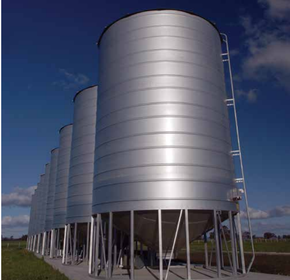
Keep it safe in silos: Storing pulses in silos that can be aerated or gas-tight sealed allows for quality and pest control not available to other storages.

Limited options: Furnigants such as phosphine or a controlled atmosphere are the only option to kill pests in stored pulses. All of which require a gas-tight, sealable storage.