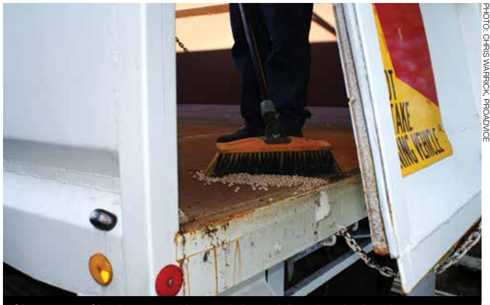
Clean sweep: Cleaning out machinery and silos and disposing of spilt grain removes environments where insect pests can survive.