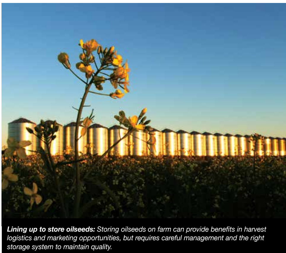
Lining up to store oilseeds: Storing oilseeds on farm can provide benefits in harvest logistics and marketing opportunities, but requires careful management and the right storage system to maintain quality.

Weather or mechanically damaged seed will deteriorate more quickly during storage than high-quality seed. When oilseeds become damaged, processes such as oxidation are in progress and difficult to slow.