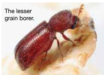
The lesser grain borer.

Three of the most common stored grain pests, the lesser grain borer ( Rhyzopertha dominica ), the rice weevil ( Sitophilus oryzae ) and the rust-red flour beetle ( Tribolium castaneum ) were contained on sections of steel treated with label rates of the DE products.